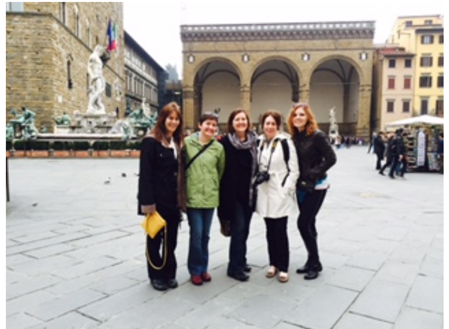
Florence & Rome Site Visit 2015